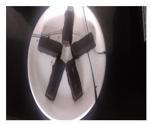
Wood apple Energy Bar