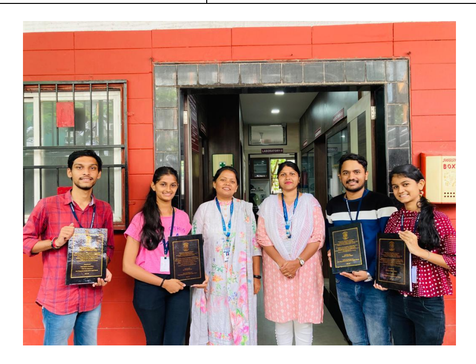
T.Y B.Voc Project Submission